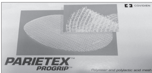
Figure 1 – Parietex ProGrip mesh manufactured by Covidien.

In 2008, Covidien launched ProGrip™ mesh (Figure 1), a self-gripping mesh indicated for the use in inguinal and incisional hernia repairs. ProGrip™ as designed